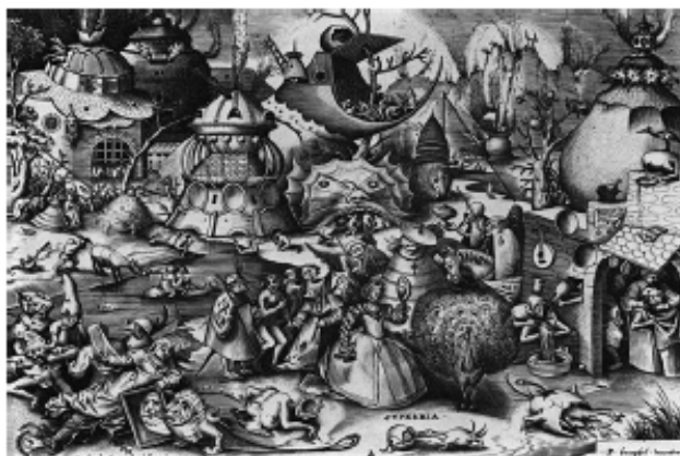
Pieter van der Heyden, after Pieter Bruegel, published by Hieronymus Cock, 1557

the "Ways of Knowing" exhibit are wall labels written by each of the seminar's participants. In addition to providing the salient features of authorship and publication, we were given space to present our own concise interpretations of the prints' import and function in a given historical setting. The old adage that a picture is worth a thousand words doesn't do justice to some of these bizarre and fantastic prints, and we've done our best to make these images as accessible as possible to the general public. To this end, a number of us were given the opportunity to share our work with the museum's wonderful and highly-knowledgeable volunteer docents. Others still presented their findings in public lectures during the annual Tucson Festival of Books, held on campus. It is our fervent hope that you too will be able to experience and take delight in these treasured artifacts, as we have. The exhibit itself runs until June 2, 2013; however, these and many other prints can be viewed anytime in the museum's online collection. •